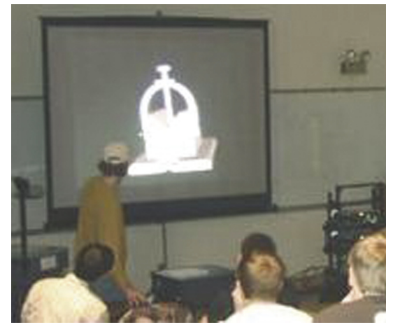
Figure 2 Second class test

Immediately following the test class, the curriculum and instruction professors and graduate