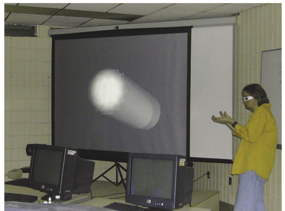
Figure 4 Fourth class test

Visual Basic programs to drive a CAD software tool for creating generic geometric forms representing mechanical parts. First, students were asked to develop a program that would produce a cylinder and a sphere with specific dimensions. They were then asked to verify their results against a VR model. Next, they were asked to modify their programs to make the center of the sphere coincident with the center of the cylinder. Again, students used a VR model to verify that the output met their expectations. Finally, students were asked to visualize shortening the cylinder by a specific amount and to produce the change by editing their programs. After their programs produced the change, they were again asked to examine a virtual model and to compare their results with their expectations (Figure 4).